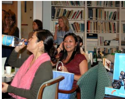
Another delicious & hilarious white elephant party!